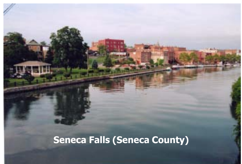
The Village of Seneca Falls' successful waterfront and main street revitalization along the historic Erie Canal in the Finger Lakes region.

Most planned unit development (PUD) local laws seek to achieve greater design flexibility and economies of scale in the development of particular land areas within the community. Above all, PUD provisions target specific goals and objectives included in the municipality's comprehensive plan. Generally, PUD local laws anticipate projects that develop a tract of land as a unit (relatively large scale, but not always) in a unified manner. For example, a community that anticipates receiving a rezoning or site plan application for the development of a large shopping mall could use a mixed-use PUD law to negotiate significant design and use changes instead of ending up with yet another commercial strip.